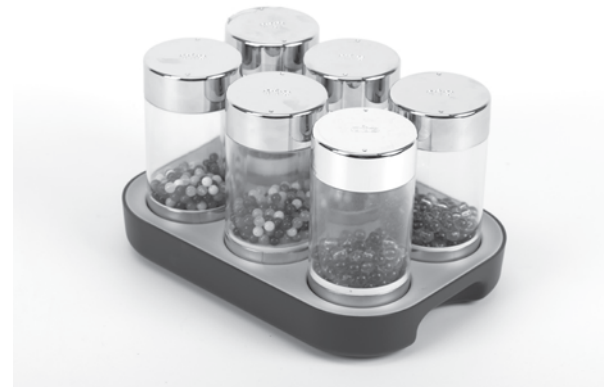
EY07202 Glow Rollers