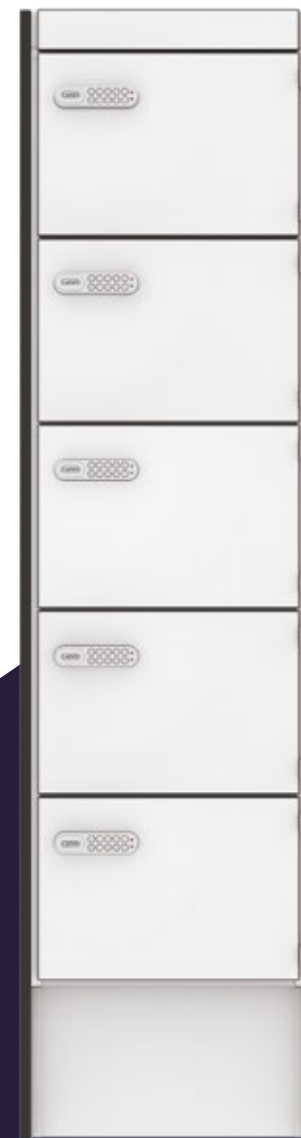
450mm Ideal for laptops & bags 135kg