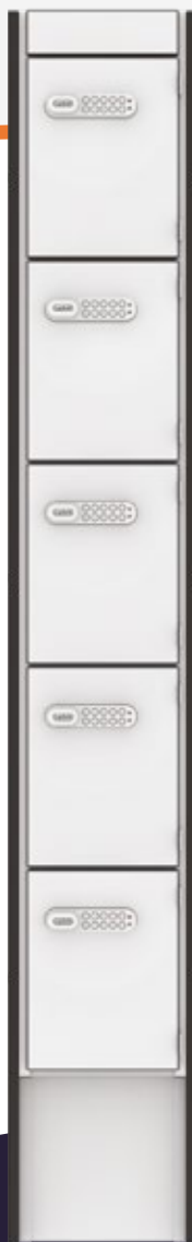
250mm Ideal for phones 105kg

FLEX™ Locker towers are 1858mm tall and 475mm deep