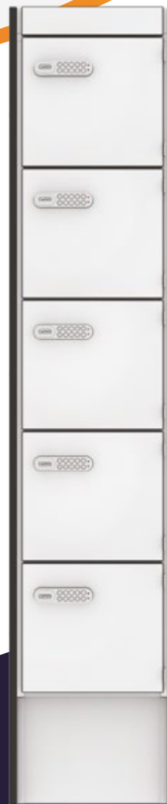
350mm Ideal for Chromebooks & tablets 120kg